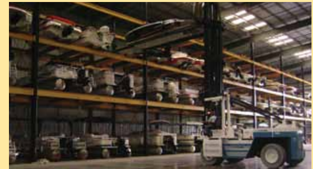
160 High & Dry Slip Marina

Dock/Ramp – The dock at the marina can accommodate any boat or watercraft with personal service and a state of the art pump out.