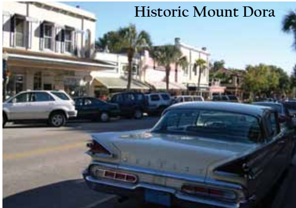
Historic Mount Dora