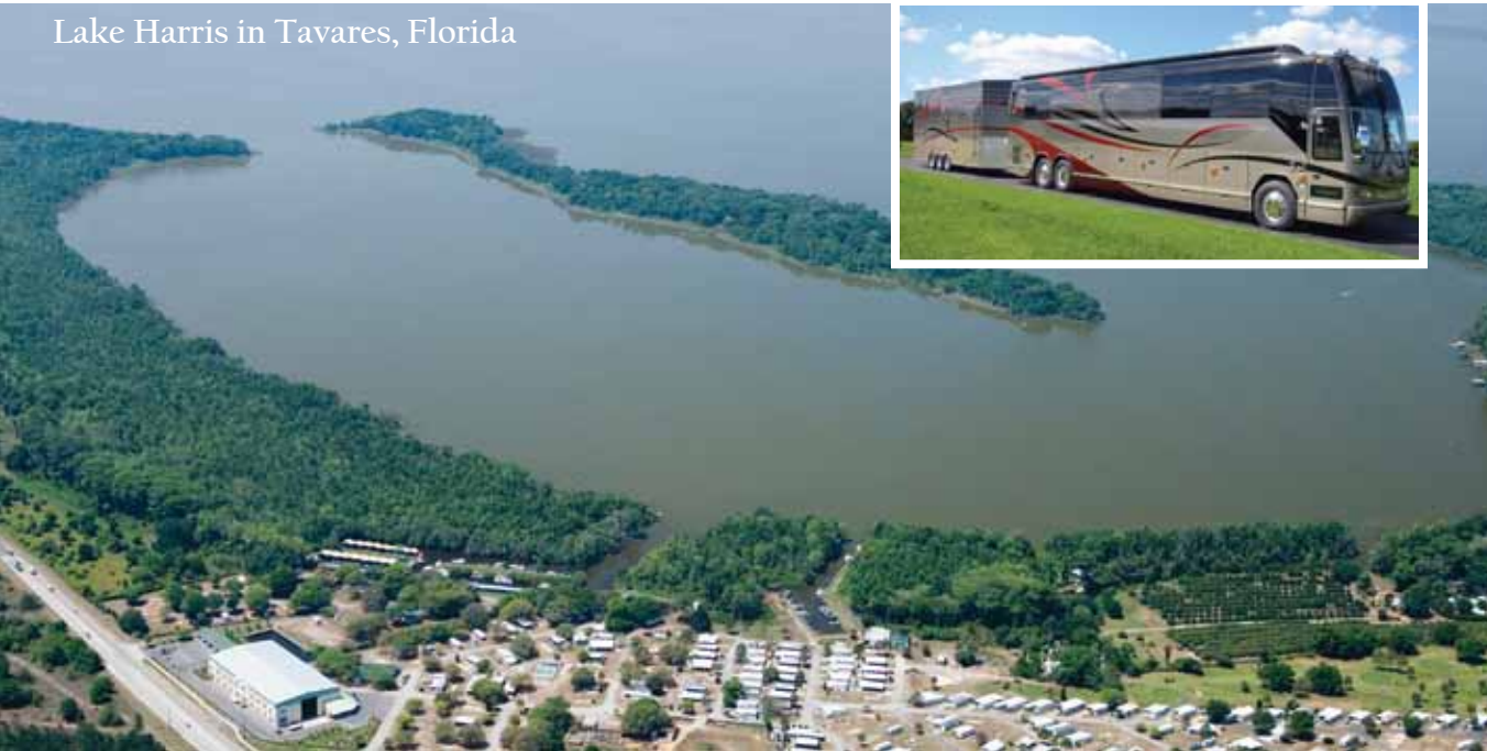
Lake Harris in Tavares, Florida